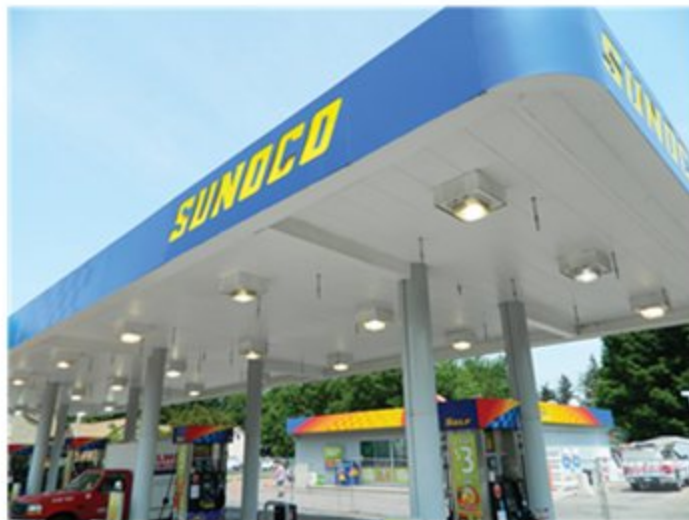
Gas Station Systems