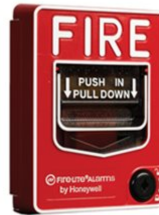
Fire/Burglar Alarms & Monitoring