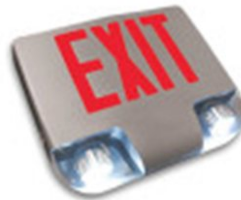
Emergency Exit Lighting